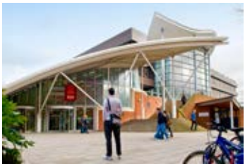
The University of Hull Union building

To represent our diverse student population Hull University Union has various 'Liberation Campaigns', societies and cultural groups e.g. BAME (Black, Asian, Minority Ethnic); LGBT+ (Lesbian, Gay, Bisexual, Transgender), Women's Committee, Disabled Students Committee and International Students Association. Find the HUU Liberation Campaigns on the first floor of the Students' Union Building – https://hullstudent.com/representation/liberation-campaigns